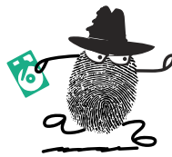
Hard drives & media material