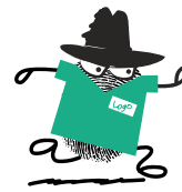
Branded products, uniforms & clothing

Contact us to find out more about our Sustainable Recycling or Confidential Shredding services.