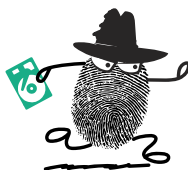
Hard drives & media material