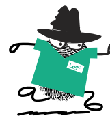
Branded products, uniforms & clothing

Contact us to find out more about our Sustainable Recycling or Confidential Shredding services.