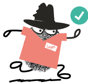
Uniforms & clothing